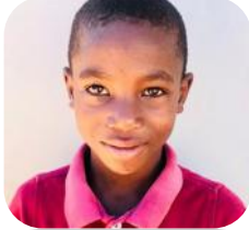
Samson - 7